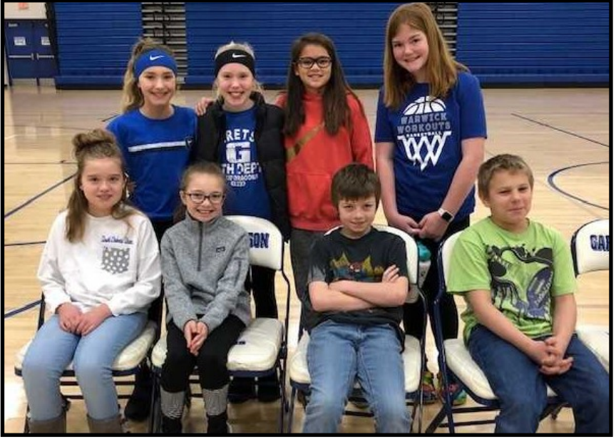
Above: Fifth grade spelling bee participants